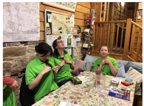
Relaxing in the Barn kitchen after so much hard work!