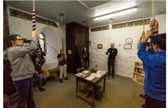
Ringing in St John the Baptist Puttenham Church

The accommodation was spacious and perfect for our needs, we hope to be back again!