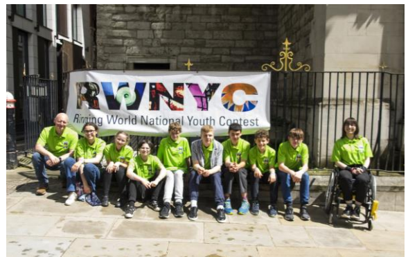
Outside St James Garlickhythe Church, London